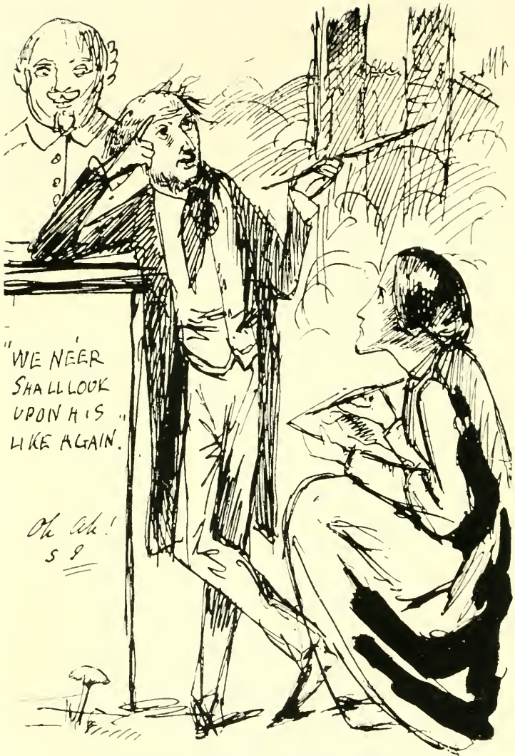
SKETCH BY DANTE GABRIEL ROSSETTI.